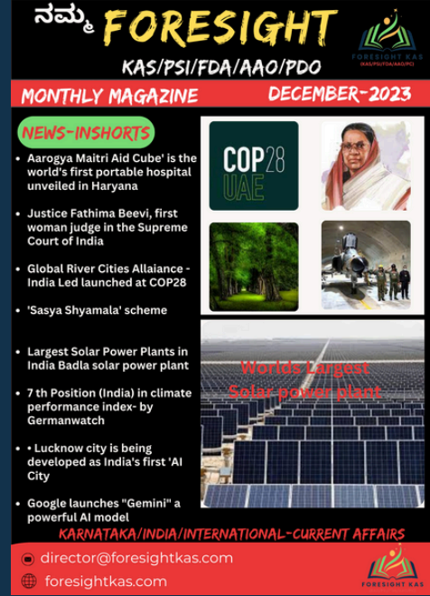
Monthly Current Affairs