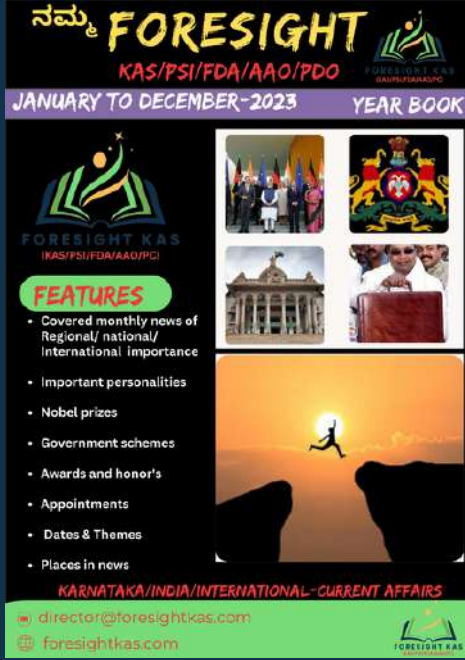
Year Book -2023