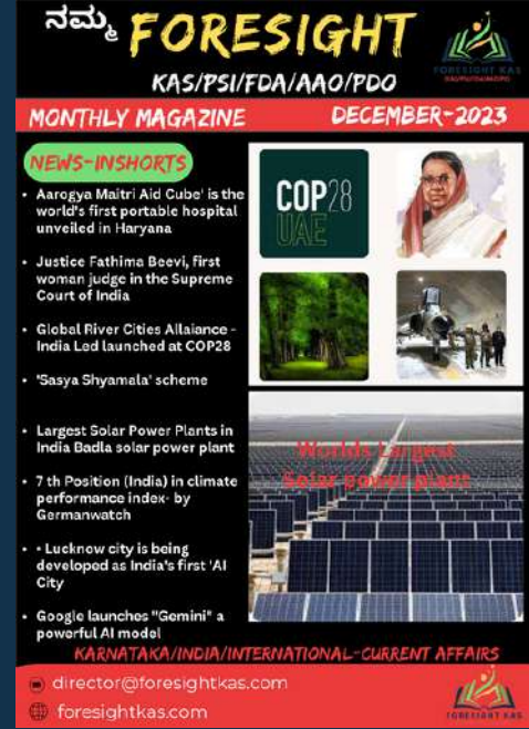
Monthly Current Affairs