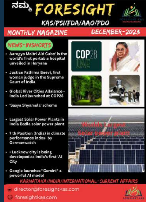
Monthly Current Affairs