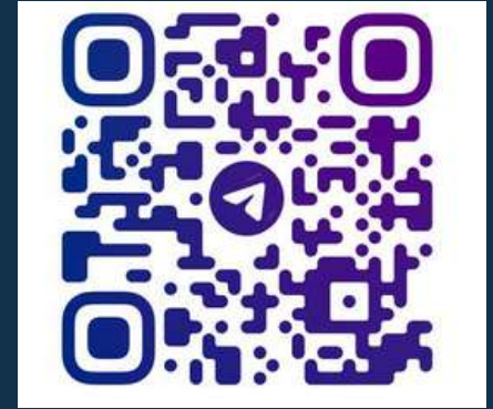
Agri warriors- Telegram