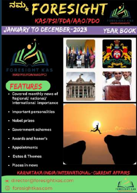
Year Book -2023