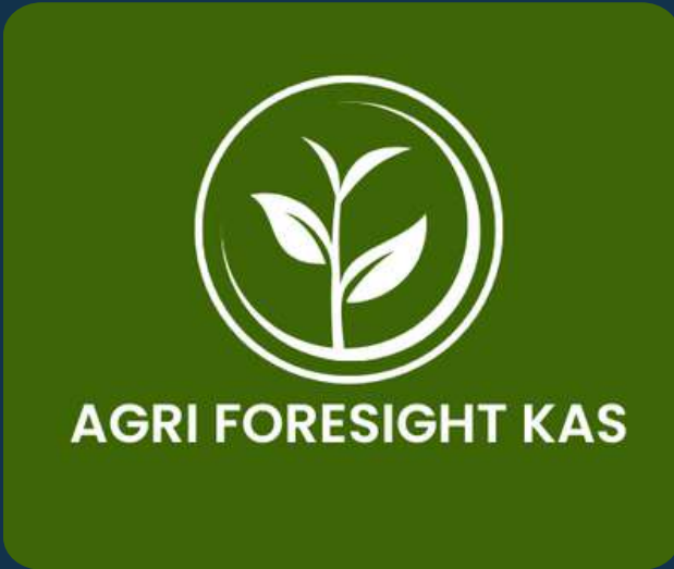
Agriculture officer exam preparation