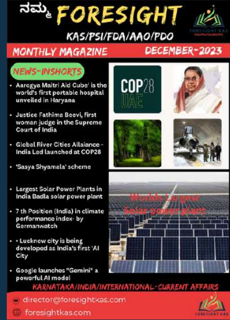
Monthly Current Affairs